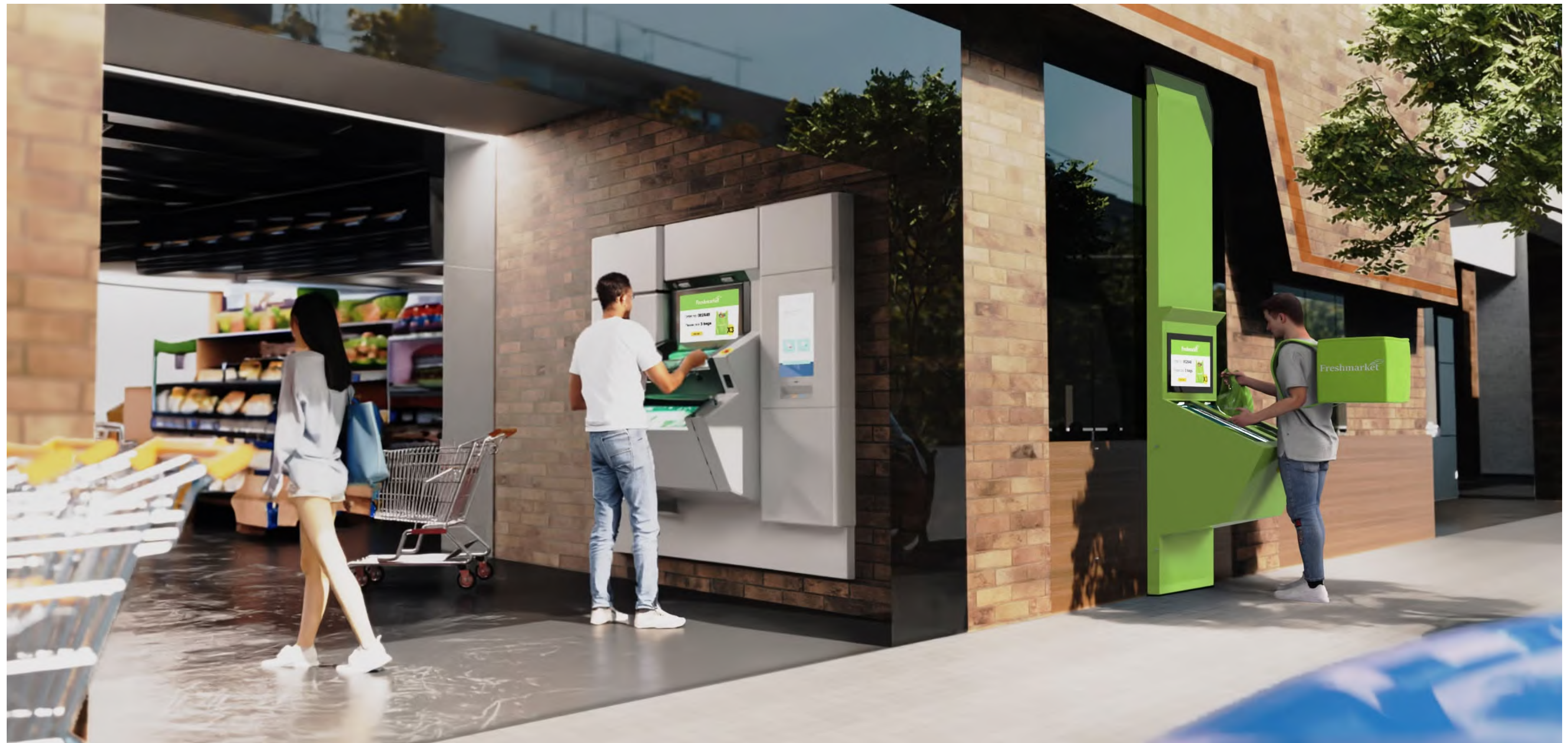
STORE-ADJACENT AUTONOMOUS STORES