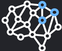
AI Segmentation in HoloCare Studio