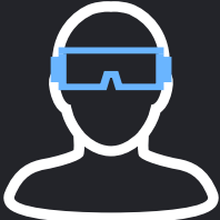
Holographic Visualization in HoloCare Reality