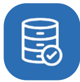
Data Security Check