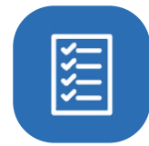
Recommendations and Next Steps