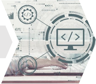
AZURE ARC FOR SQL

Workshop, Assessment, Design and Implementation