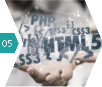
AZURE ARC FOR SQL MANAGED INSTANCE