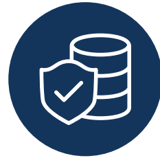
Security & Access Management