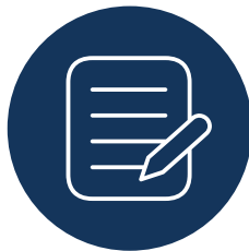
Capacity Planning & Resource Management