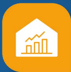
Modern Data Platform