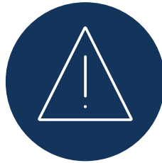
Monitoring & Alerting