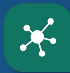
AI & Data Science