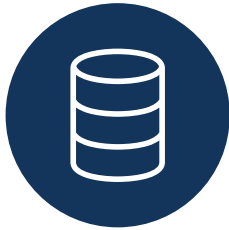
Database Management & Maintenance