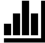
Data Capture Power BI Reporting