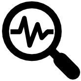
Data Capture App Development