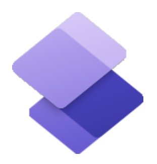
for building secure, data-centric business websites