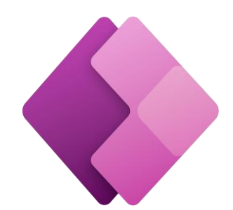
Power Apps for web and mobile application development

Taking your organization to the next level with Microsoft Power Platform