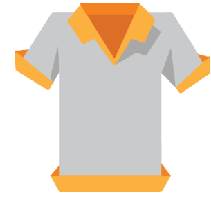
Fashion & Lifestyle