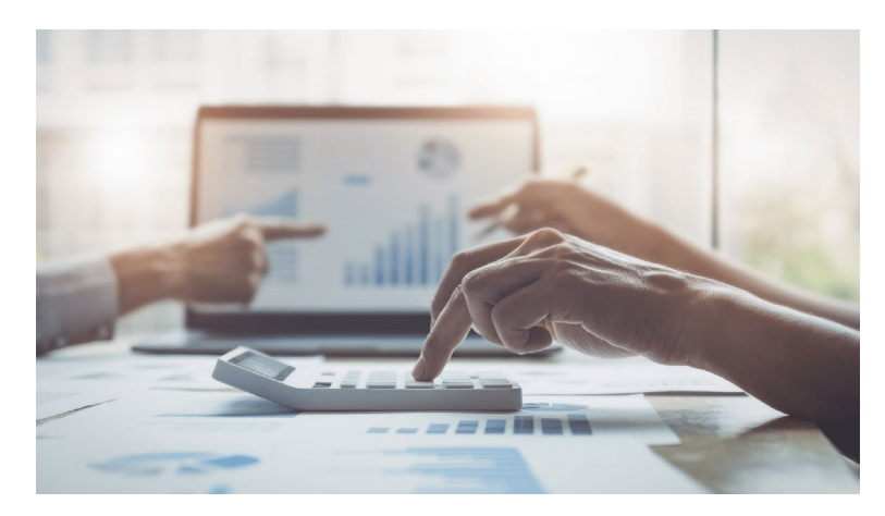
Analytics & BI Data