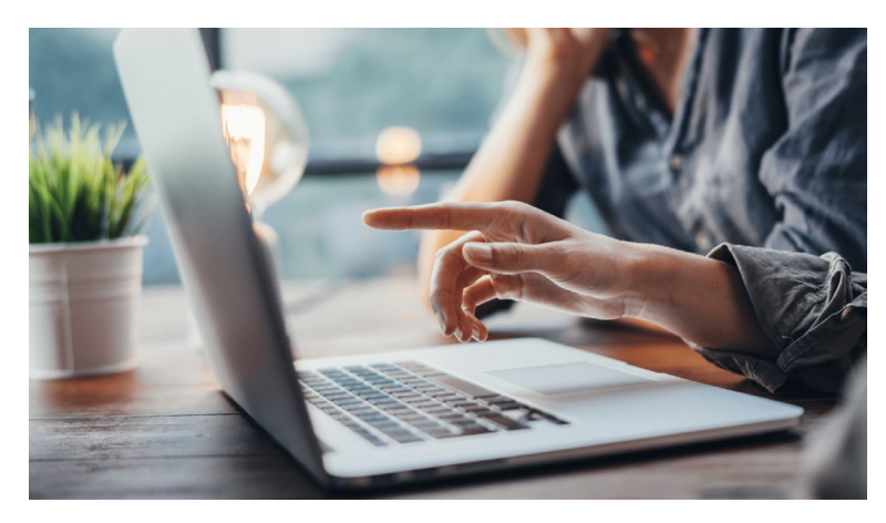
Smart Office Solutions