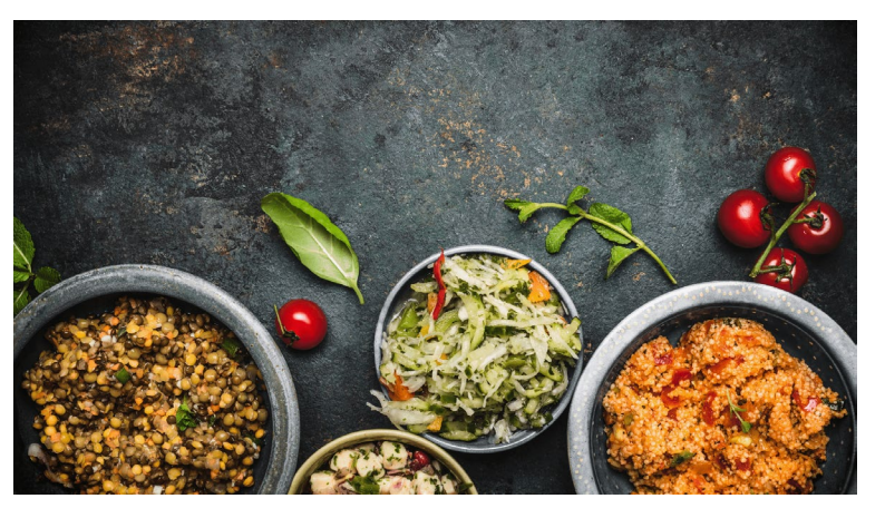
Services & Catering