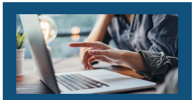
Add-On Products' website Simplify your workspace