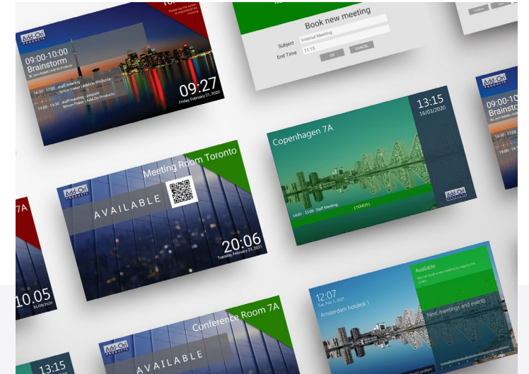
Enhancing Collaboration and Efficiency in the Modern Office