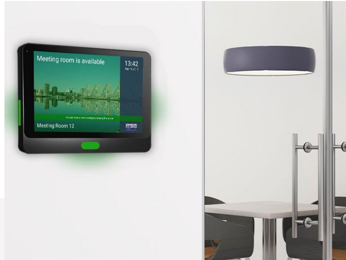
Options for Customizing Meeting and Conference Room Signs