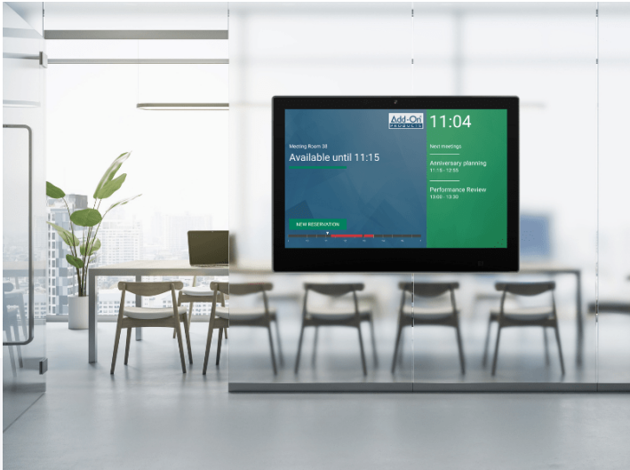
Top Digital Signage Trends in 2025 to Consider