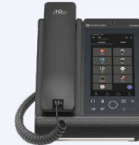
C470HD IP Phone

The AudioCodes 400HD series of IP phones and the AudioCodes Room Experience (RX) suite are easy-to-use, feature-rich products and solutions for boosting your workplace productivity by ensuring a superior Microsoft Teams experience from any location.