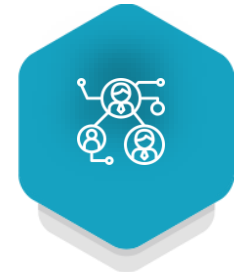
Courier Recommendation Engine