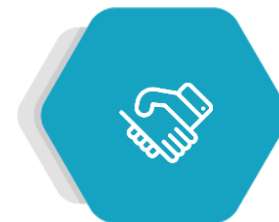
Delight Customer Support