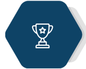
Automated Order Confirmation