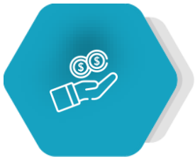
Advertising and marketing outlays