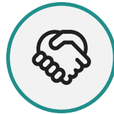
Collaboration & Engagement