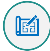
Bespoke Technology Roadmap

Unify Data Intelligence. Drive Actionable Insights.