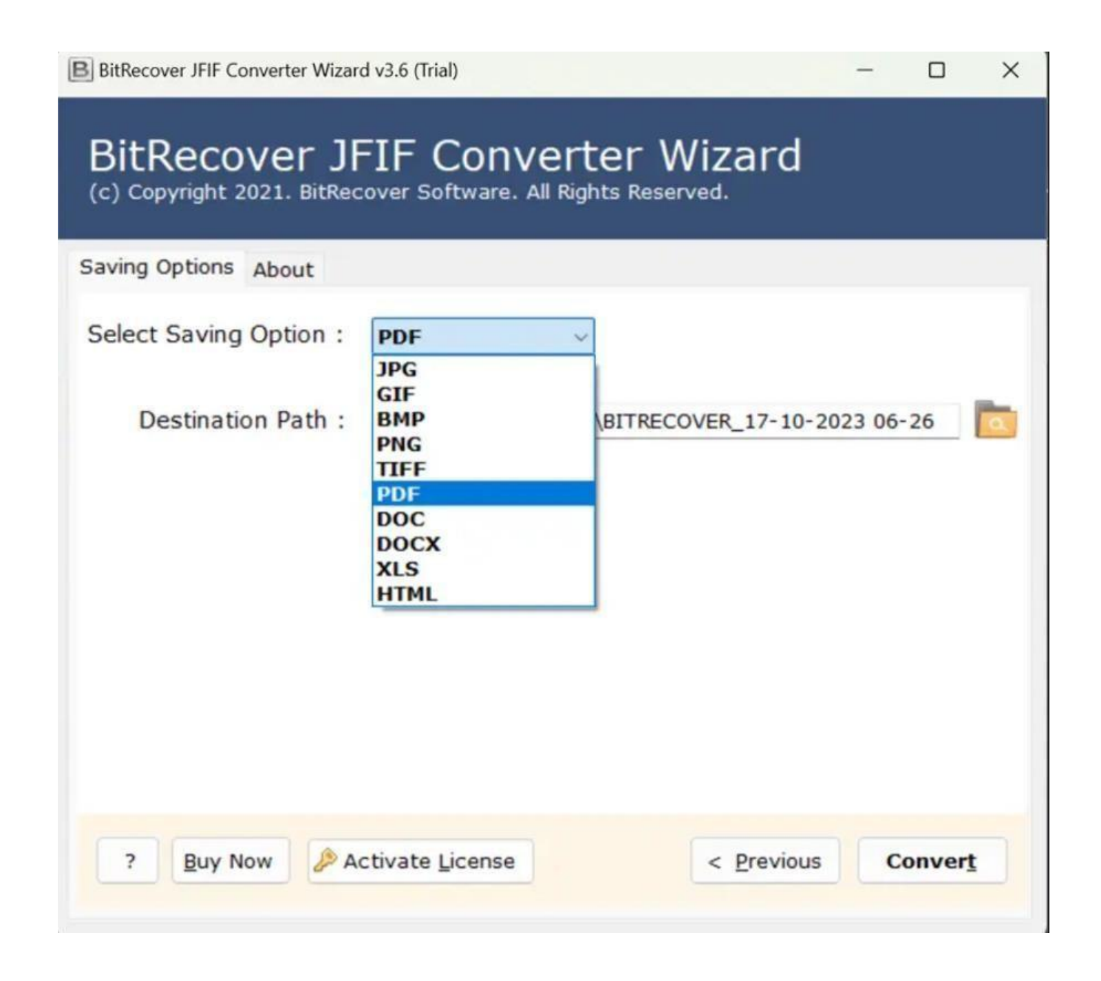
Step 4: Select a destination path to store resultant files and click Convert button to start conversion process.

By following the above 4 steps, you can efficiently convert your JFIF files to PNG. The software's intuitive interface and batch conversion capabilities ensure a smooth and time-saving experience. Whether you are dealing with a single image or multiple files, this tool offers the reliability and efficiency needed for effective image management.