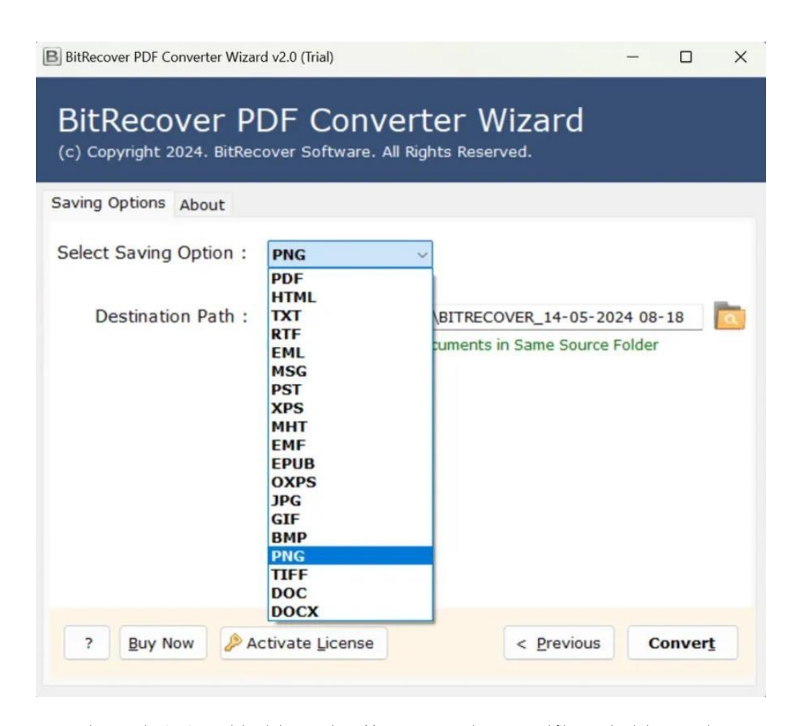
Step 5: Choose a destination path by clicking on the Folder icon to save the converted files. Lastly, click Convert button to start the conversion process.

By following the above 5 steps, users can efficiently convert PDF files to PST format. The software's intuitive interface allows for easy addition of files or folders, selection of specific PDF documents for conversion, and choice of output formats. Its batch conversion capability ensures that even users with extensive collection can manage the process seamlessly.