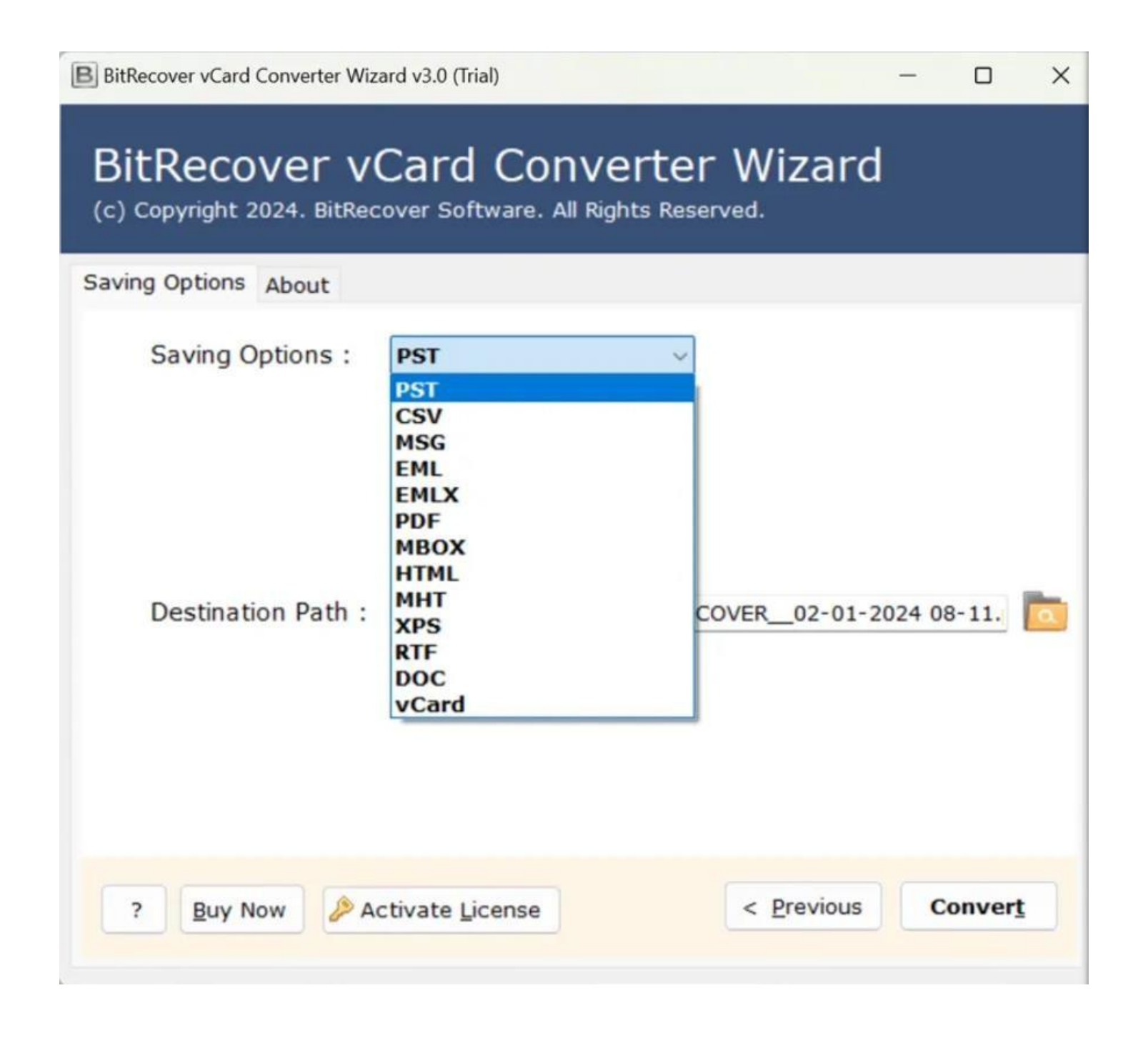
Step 4: Browse for a destination path where you wish to store the converted files and click Convert button.

By following the above 4 steps, you can efficiently convert your vCard files into PDF format. This software's intuitive interface ensures that even users with limited technical expertise can navigate the conversion process with ease. Its compatibility with various formats makes it a versatile choice for users seeking to manage their contact information across different platforms.