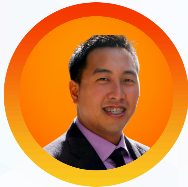
Tony Hsieh Co-Founder Services

At C1st Technologies, our journey is guided by a team of experienced and visionary leaders who bring a wealth of knowledge and expertise to the table. Get to know the individuals who drive our company forward and inspire our commitment to excellence.