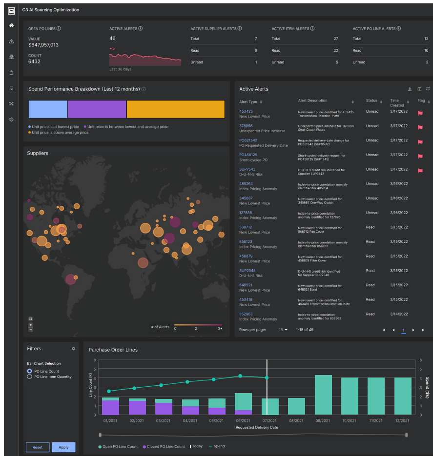
Figure 1. C3 AI Sourcing Optimization provides a single pane of glass view into all sourcing operation.