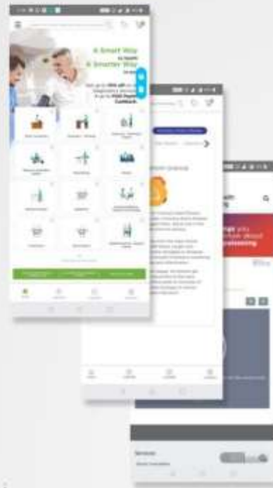
Service Information and Booking