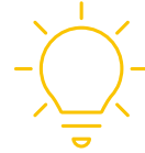
Teams Apps & Solutions Workshop

*Whilst Changing Social are able to run and apply for the Microsoft Cloud Accelerator Workshops, there is no guarantee you will receive funding on the application, as there is a strict criteria to meet.