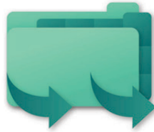
File & Migration