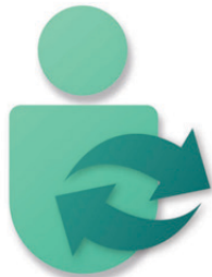
Identity & Sync