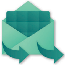
Email & Migration

The ultimate tools for enhanced collaboration