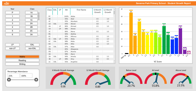
Measure Student Growth