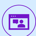
Self Service Training