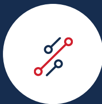
AI Readiness Analysis