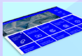
E-Learning & on-demand

The Consensus Virtual meeting tools offers you everything from livestreaming to video rooms integrated into the Consensus Meeting platform, giving you the options to fully tailor your event