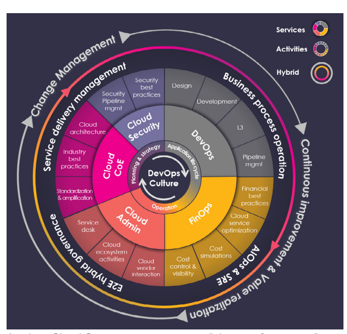
Amdocs Cloud Operations span across "planning & strategy" (include Cloud CoE and security), "application lifecycle" (DevOps) and "operations" (including cloud admin and FinOps).

environments, e.g. multi-cloud and on premise/data centers. By using a robust automation platform, as well as DevOps tools and extensive monitoring and governance layers, it provides operators with total visibility of application performance and financial operations (FinOps). All Amdocs cloud operations services are configurable, to enable the 'shift-left' of teams while eliminating the need for development coding.