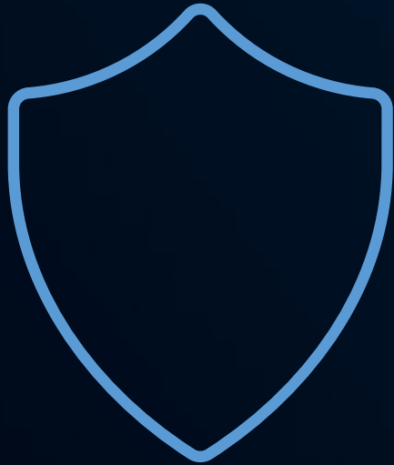
Information Governance and Data Management