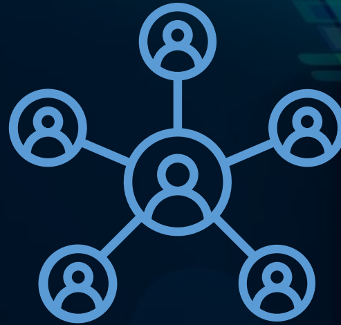
Organisational Change Management