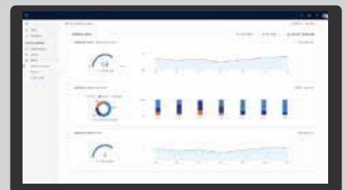
Drive action with real time feedback