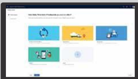
Capture feedback instantly