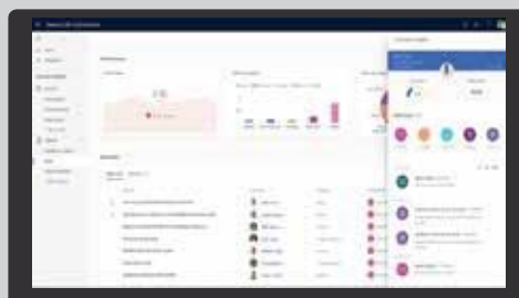
Integrate data for deeper customer insights