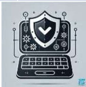
Security and Compliance