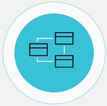
CUSTOM POWER APPS COMPONENTS

To meet unique Client needs and unlock the power of the solution, EPAM frequently opts for customization and development of an innovative solution. EPAM provides a custom development service to extend the platform capabilities or create new custom functionality that can broaden the horizon of platform in terms of applicability to the Client business. The team of experts has a profound experience in the below customizations and is seasoned in their adoption to MS Dynamics 365 solution.