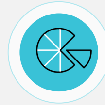
STAND-ALONE SOLUTIONS FOR EXTENDING POWER APPS FUNCTIONALITY