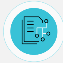
CUSTOM API FOR COMPLEX INTEGRATION SOLUTIONS