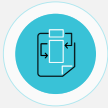
CUSTOM CONNECTORS FOR POWER AUTOMATE