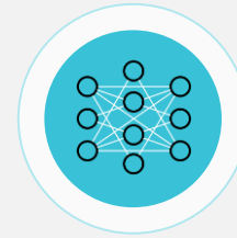
ORGANIZED INTERACTION WITHIN HYBRID CLOUD

EPAM is eager to help businesses with any level of complexity to find the best solution that fits the Client needs. Though the OOTB functionality of MS Dynamics 365 covers a wide spectrum of business needs, the company is ready to adjust modular capabilities to industry specifics, particular business processes and user experience.