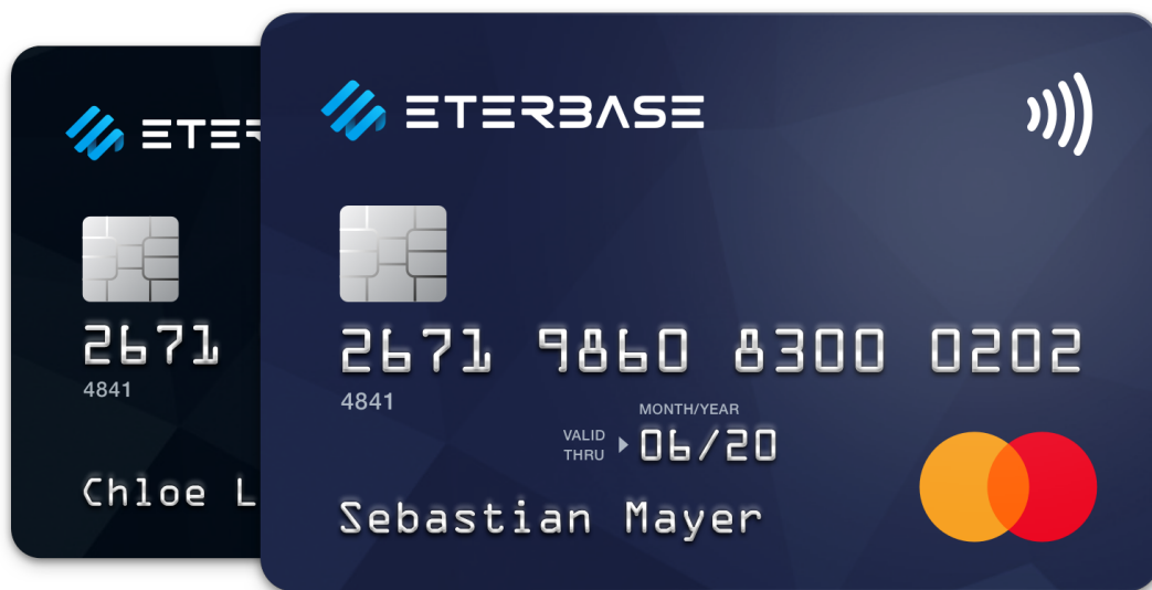
ETERBASE Debit Cards Preview

In order to foster utility value for digital assets, we are planning to team up with our partners and introduce the possibility of utilizing pre-paid and debit cards to hold both balances in cash and e-money as well as in digital assets.