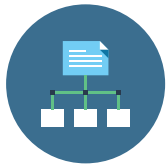
Retention Schedule & Legal Holds Management