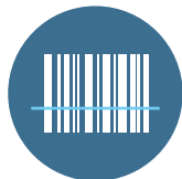
File & Asset Tracking via Barcode or RFID