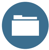
Track Physical Records & Assets