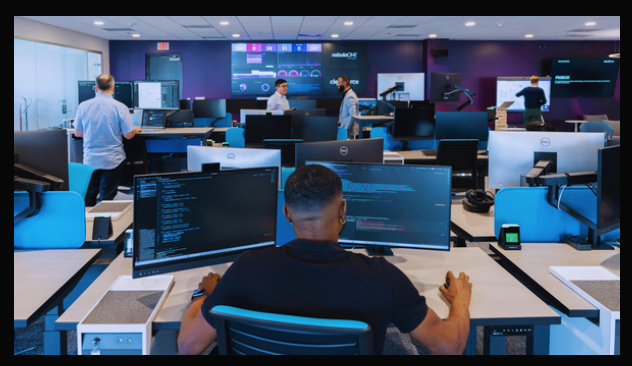
Every deployment is robustly supported by our Microsoft-certified SMEs, and automatically updated with the latest models and features.

Brand your Al to match the look and feel of your brand, while maintaining a familiar and intuitive chat interface to expedite user adoption.