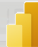
Power BI Business analytics