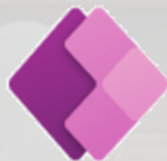
Power Apps Application development

Smart, interactive dashboards Analyse stats & KPI's Track turn-around times Generate audit reports