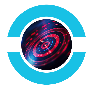
Project-Based Engagements: Defined-scope initiatives with dedicated teams delivering high-impact results.