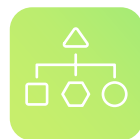
Data Acquisition Engines

Harmonya processes millions of data points from online product interactions to extract the most relevant product insights. This powerful integration of data equips your teams with the knowledge to craft strategies that target market opportunities based on actual product performance.