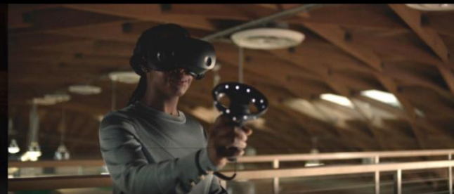
Connect from anywhere