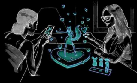
Connect and create