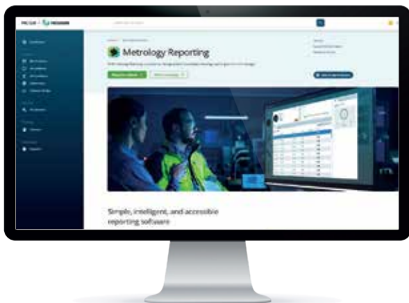
Easy access to products, training & support