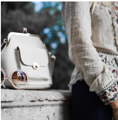
03 – Fashion Retail