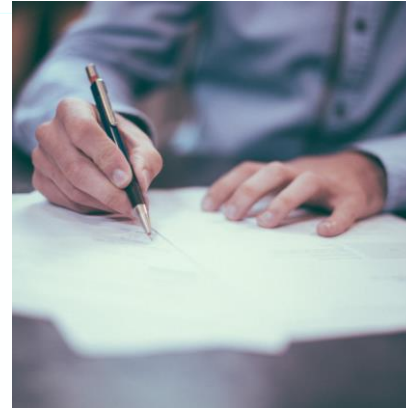
02 - Insurance