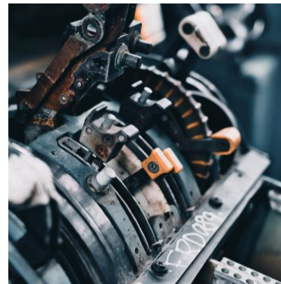
04 - Manufacturing