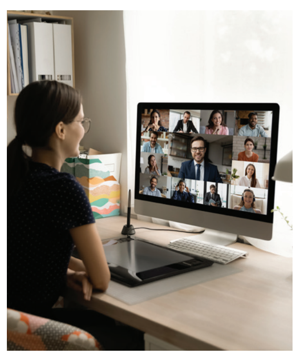
You live in different parts of the city and still are all together!