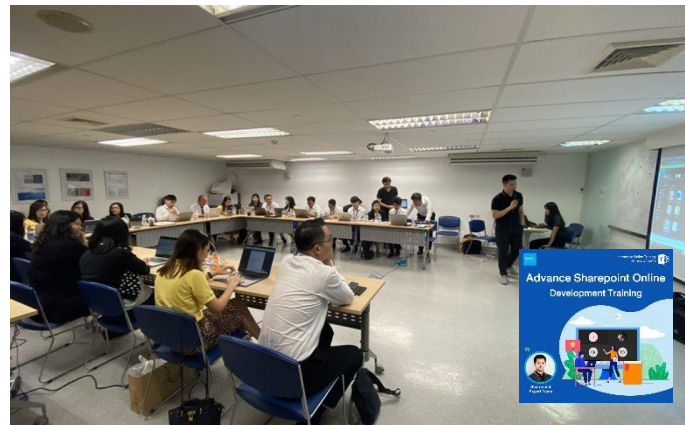
TRAINING / WORKSHOP / HACKATHON