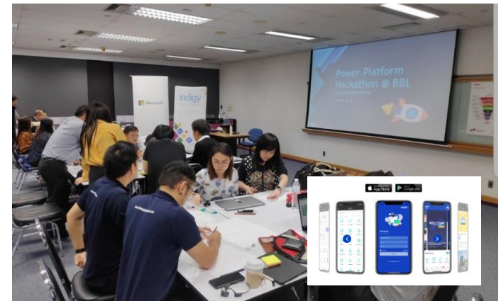
SOLUTION & PLATFORM IMPLEMENTATION