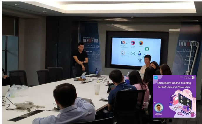
DESIGN THINKING & CONSULTING

We deliver Digital Transformation Platform to boost your business in area of Work Productivity, Automation Artificial Intelligence, Automation, Commerce and Internet of Things.