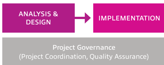
Diagram: Insight's 2-phase approach for Azure Data Services Foundations

Our two-phase approach incorporates an assessment and design phase to ensure your business and data requirements are well understood, prior to executing the implementation phase.