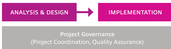
Diagram: Insight's 2-phase approach for Azure Virtual Desktop Foundations

AU: 1800 189 888 au.insight.com NZ: 0800 933 111 nz.insight.com SG: +65 6495 2995 sg.insight.com