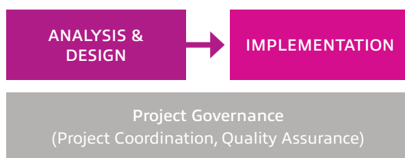
Diagram: Insight's 2-phase approach for Azure Data Services Foundations

During the first phase, we review your organisation's and application's unique requirements in order to tailor and fast-track the deployment of a fit-for-purpose Azure based Web Application. Key security, governance, cost control and operational requirements are addressed together at the start of the project through a series of collaborative workshops and knowledge transfer sessions. During the implementation phase, Insight's Cloud Application Modernisation team will assist to get your app running in the cloud in alignment with best practices and organisational standards.