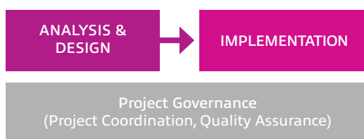
Diagram: Insight's 2-phase approach for Application Modernization