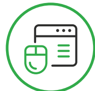
Create Reports and Dashboards

Angles for SAP puts the power of operational analytics and business intelligence into the hands of the people who need it most – the business users. With a library of out-of-the-box report templates, your team can quickly deliver actionable insights. Answer critical questions across procurement, supply chain, sales & distribution, finance, plant maintenance, human capital management, information technology, and risk & compliance.