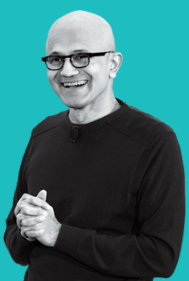
Satya Nadella CEO Microsoft

“Microsoft 365 Copilot is the ultimate expression of our mission to empower every person and every organization on the planet to achieve more. It’s a new way of interacting with technology that is natural, intuitive, and adaptive.”