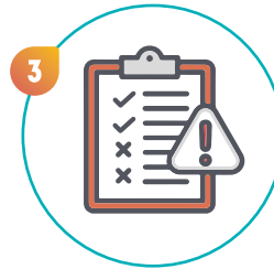
Loss of Visibility & Control to achieve Data Sovereignty Compliance

We very much need a secure digital space for file exchanges and collaborations to mitigate file security risks driven by expanding attack surfaces and increasingly advanced cyber threats.