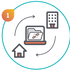
Weakened File Governance due to Hybrid Working & Shadow IT

The constantly evolving digital workplace has created new challenges that are often overlooked until data breaches happen.