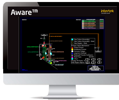
AutoCAD Drawing Interface

Mobile Aware Integrity Management Software captures visual and NDE inspection findings electronically while the inspection is taking place, consequently saving time and reducing errors. Users are also able to access and review information collected from previous inspections while in the field. Tablet or ruggedized hand held device options are available.