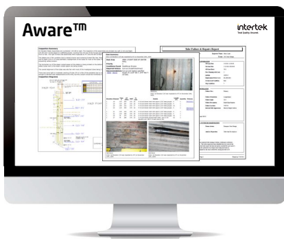
Aware Report Generation

Automatic outage planning recommendations prompt planners to create necessary work orders and work scopes for an upcoming outage.