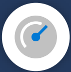
Assess & Design