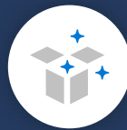
Enable & Migrate