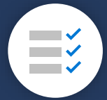
Adoption & Change Management